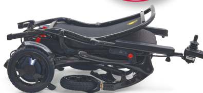
East One-Step Folding for Transport